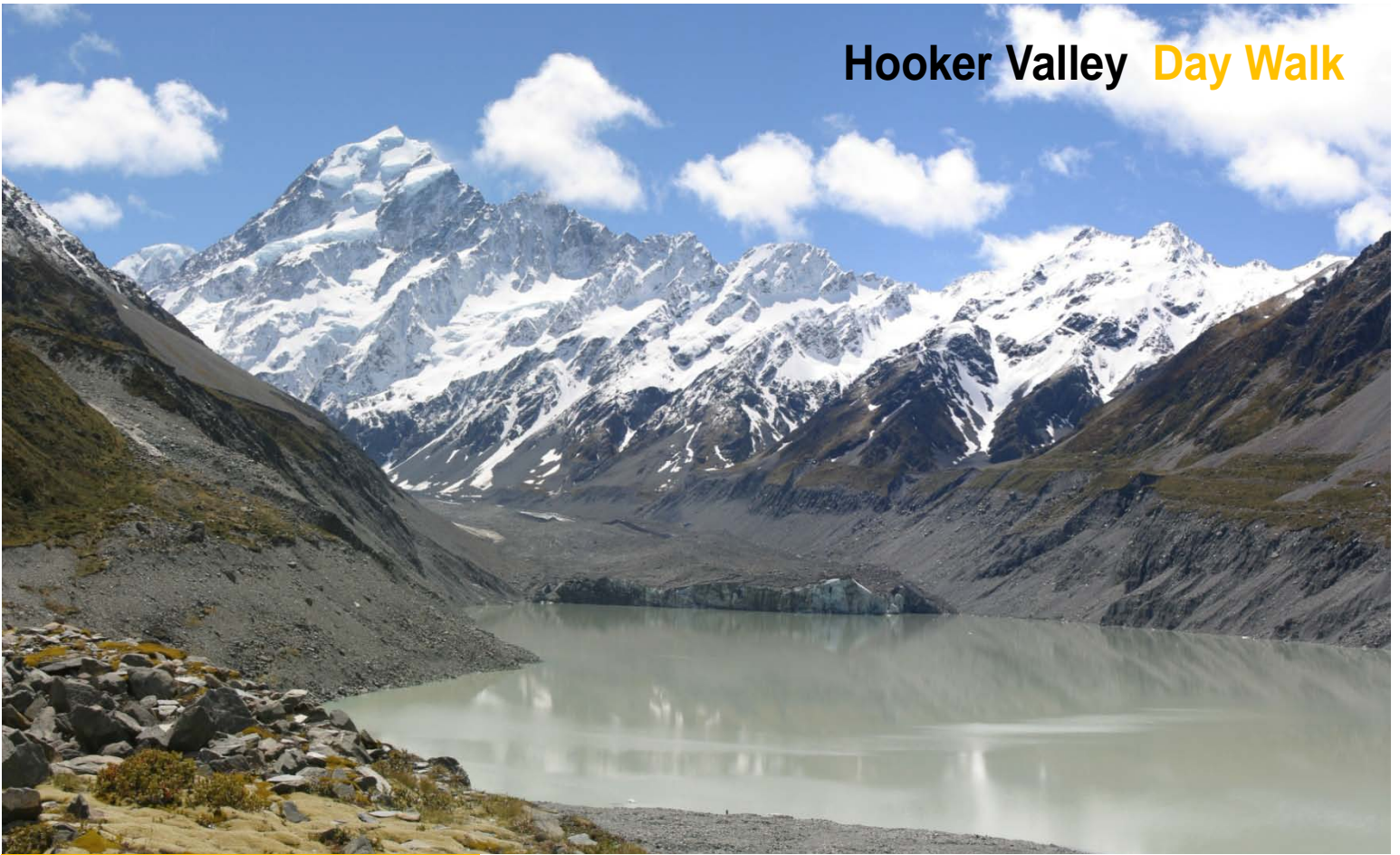
Hooker Glacier with Aoraki /Mount Cook in the background.

Are you looking for a guided walk in one of the worlds most spectacular regions?