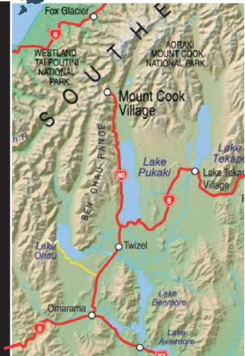
Queenstown, Wanaka Oamaru, Dunedin